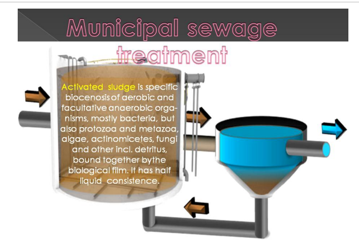
Figure 4: Sketch of secondary sewage treatment in activated sludge tank connected with secondary clarifier (activation – intensification of processes ongoing in nature)

Sewage treatment (or domestic wastewater treatment, municipal wastewater treatment) is a type of wastewater treatment which aims to remove contaminants from sewage to produce an effluent that is suitable for discharge to the surrounding environment or an intended reuse application, thereby preventing water pollution from raw sewage discharges. Sewage contains wastewater from households and businesses and possibly pre-treated industrial wastewater. There are a high number of sewage treatment processes to choose from. These can range from decentralized systems (including on-site treatment systems) to large centralized systems involving a network of pipes and pump stations (called sewerage) which convey the sewage to a treatment plant.