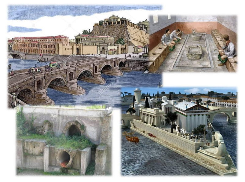
Figure 1: Ancient Rome factual approximation.

Sewage farms (i.e. wastewater application to the land for disposal and agricultural use) were operated in Silesia in 1531, in Scotland in 1650, in Paris in 1868, in Berlin in 1876 and in different parts of the USA since 1871, where wastewater was used for beneficial crop production. In the 16th and 18th centuries in many rapidly growing countries/cities of Europe (e.g. Germany, France) and the United States, "sewage farms" were increasingly seen as a solution for the disposal of large volumes of the wastewater, some of which are still in operation today. Irrigation with sewage and other wastewater effluents has a long history also in China and India; while also a large "sewage farm" was established in Australia in 1897 (Chant, 2005).