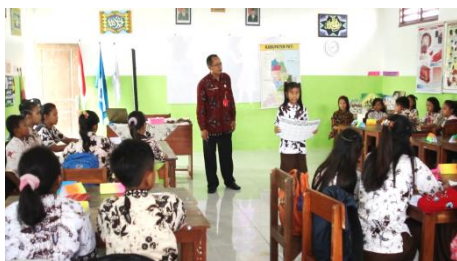
Figure 5: Exploring the districts in Pati regency.

In the final activity of the learning at that film, the teacher asks students to conclude their experience when following the learning process and asks students to express their dreams in the future, and conduct a learning evaluation. The following pictures below show the implementation of local wisdom based learning film.