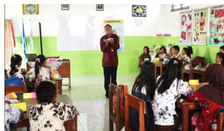
Figure 6: Introducing potency and the natural resource of the Pati Regency.