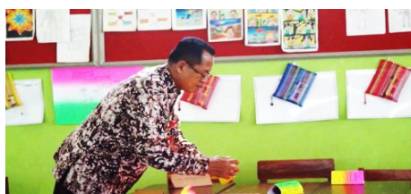
Figure 3: The teacher prepares cooperative learning.