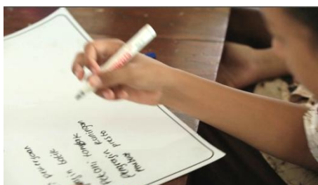
Figure 7: Exploring the types of occupation based on the potency and natural resource at Pati regency.