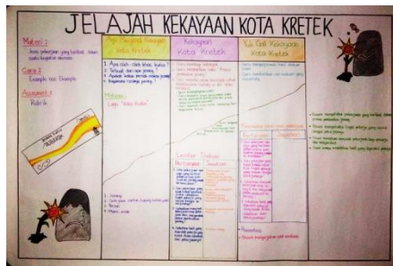
Figure 11: Learning design of Kudus local wisdom based thematic learning.