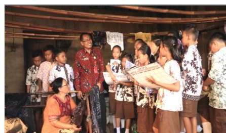
Figure 8: Visitation to Batik Bakaran workshop.