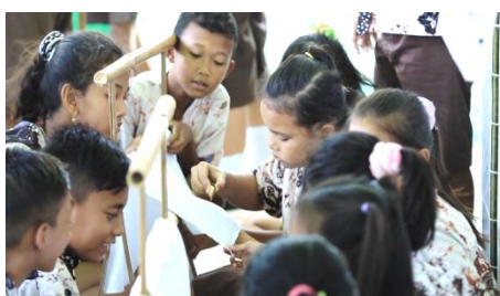
Figure 9: The practice of making batik.