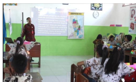
Figure 10: Final evaluation.