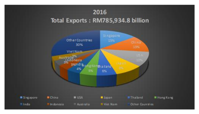
Figure 1. Malaysia's total exports