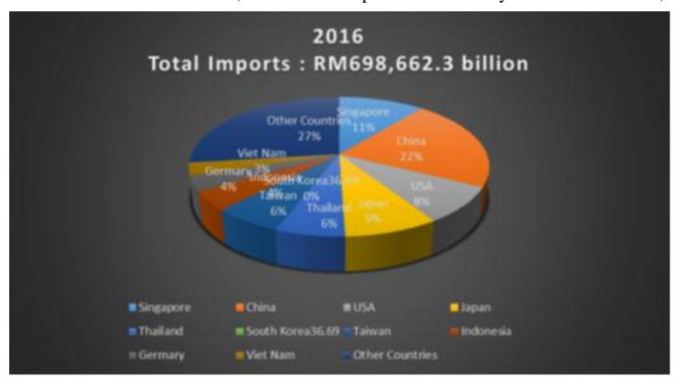
Figure 2. Malaysia's total imports

This section will discuss the international trade, which is the import area for Malaysia in the short-term, which is in 2016.