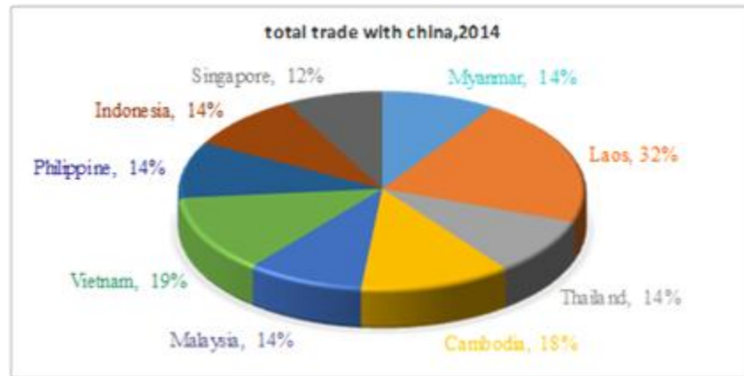
Figure 1. International political economy between China and ASEAN regions

In international political economy, two theories, namely, classical political economy (Adam Smith and David Ricardo) and Marxist political economy are used. Classical political economy is seen as a complex natural organism where human labor is a key source of wealth. This theory explains about the division of labor and key role of the market as an integrating force. This also explains the harmony of interest between classes where it is about the key role played by the state in maintaining a market economy.