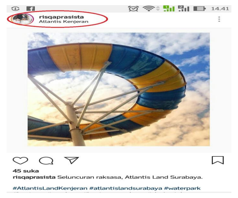
Figure 3: The Instagram Account of Visitor of Atlantis Land Surabaya

Instagram is one of the social media that can be used as a promotional product or service. Social media Instagram is created so that smartphone owners will feel that the camera installed is not in vain (Mahardika & Farida, 2019). Instagram is a digital filter, and share it with various Social networking services, including those owned by Instagram. One of Instagram's unique features is cutting the image into a square shape, so it looks like an Instamatic Kodak camera and Polaroid. In addition, Instagram also can be directly connected to other social media applications such as Facebook and Twitter. Instagram is also capable of doing the photo editing process before it is uploaded to the network. Photos uploaded are also not limited to a certain amount.