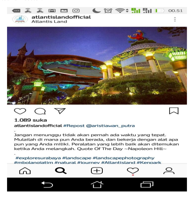
Figure 1: Instagram of Atlantis Land Official

Instagram aimed at promoting a worthy cause can lead to a higher good. Sharing event images and videos can help followers feel like they're in the action and are a real part of the community. Hashtags used by PT. Granting Jaya as an effective tool to make the name of Atlantis Land Surabaya become more viral and famous as a current issue in the city of Surabaya, especially In the tourism sector.