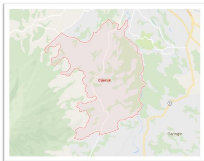
Figure 1: Map of Administrative Village of Tajur Halang, Cijeruk, Bogor

Their farms/plantations are located in the hills so that many hills do not have cambium trees that have strong roots to hold the soil on each slope. But they mitigate through making waterways around their plantations and making terraces or steps as their land for gardening.