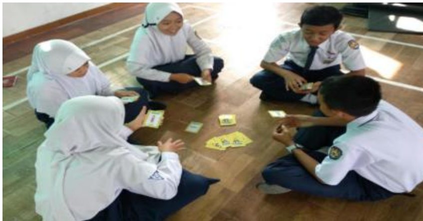
Figure 1: Playing games using the concept of Javanese speech level

The students participate in various games during the main activities. These games consist of three levels, i.e., levels 1, 2, and 3. In level 1, the students are asked to find the collocation of the vocabularies in ngoko (common), krama (moderate-polite), and krama inggil (high - polite) style written on a special necklace. The concept of the level-2 game is to arrange a sentence based on the Javanese speech level style using special flashcards called figure card and verb card. Meanwhile, songs and special flashcards were utilized in the level-3 game. The level-1 game helps the students improve their understanding regarding several vocabularies in ngoko (common), krama (moderate-polite), and krama inggil (high - polite) language style. Level-2 game is significant to the students' comprehension regarding the Javanese speech levels, and level 3 is significant to the students' comprehension and application of the concept.