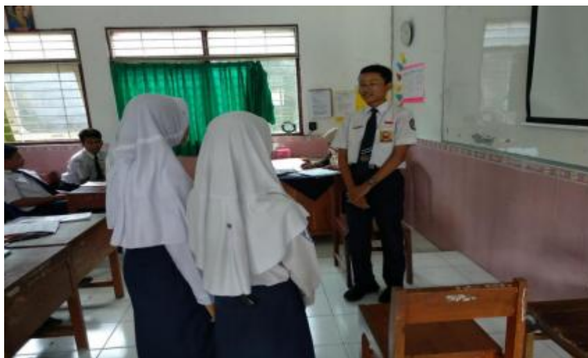
Figure 2: Conversation between students

The teaching and learning process in the control class refers to the lesson plan for direct instruction. The total classroom sessions are similar to that of the experimental class, i.e., four-meeting sessions (three meetings of regular class and one meeting allocated for evaluation). As many as 25 students involved in this class.