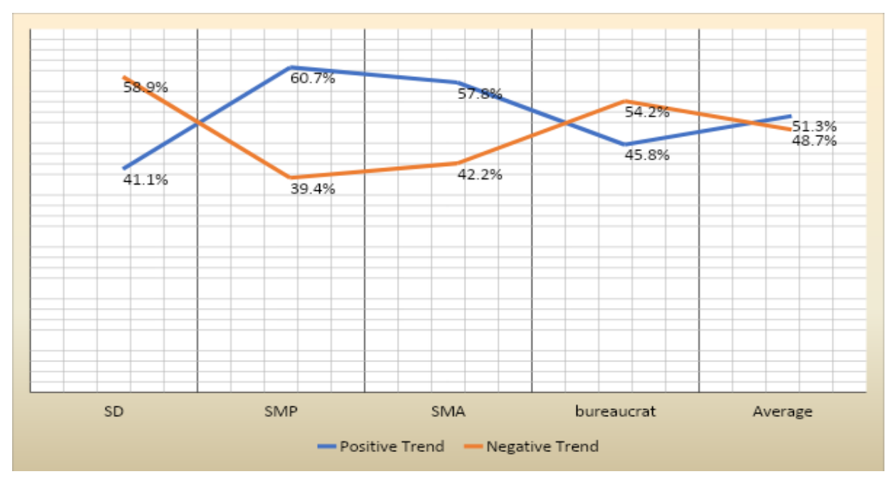
Figure 1: Trend of attitude toward SBM according to school stakeholders and district education ministry bureaucrats

However, other forms of the commitment of the stakeholders toward the implementation of SBM can be traced through the attitudes of stakeholders.