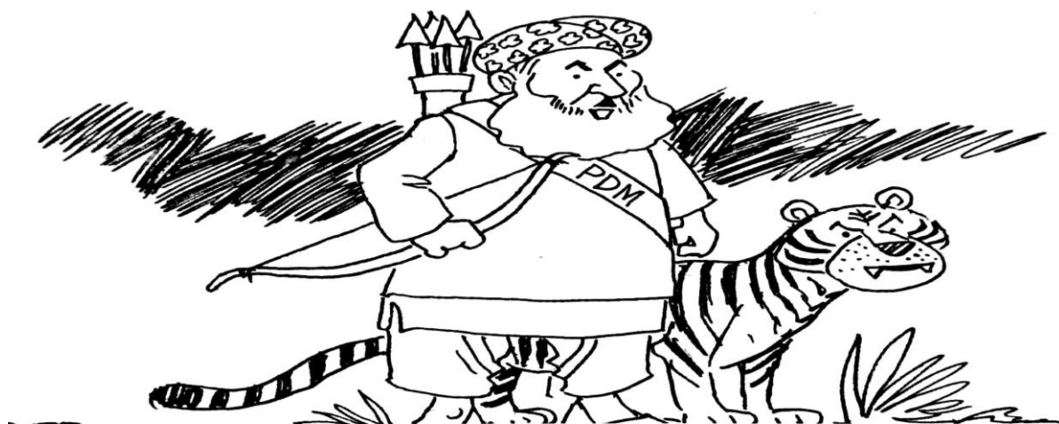
Figure 1: Molana Fazul Ur Rehman Leading the PDM