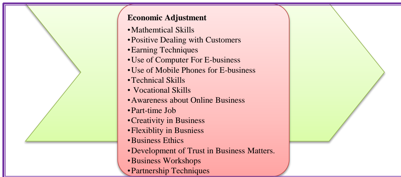
Figure 1: Conceptual Framework