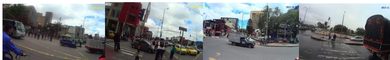
Figure 3: Sampled intersections in Carrera 7 x Calle 19 (4-lane) (LOS=4.2); Carrera 19 x Calle 13 (LOS=4.9); Carrera 13 x Calle 34 (LOS=4.5); and Carrera 80 x Calle 38c (LOS=4.2)