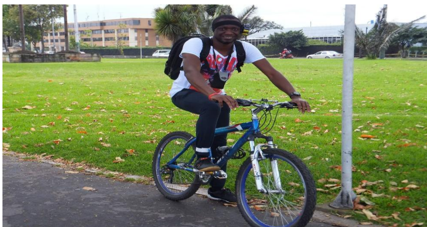
Figure 1: Display of camera position as used by the author during field survey