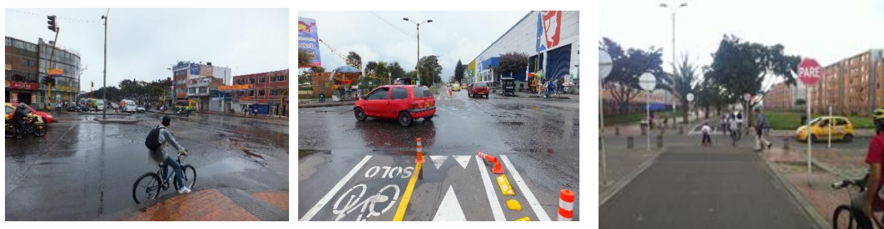
Figure 2: Illustration of some intersection categories in the study area

Conflicts with other cyclists, pedestrians and other wheeled tricycles impede cyclist's ability to cross intersections and thus affect their satisfaction. Videotapes from field observations reveal this as a problem in Bogota. The study, therefore, considers a value of 1 for \geq 3 conflicts, 0 otherwise. This data is observed from collected video clips.