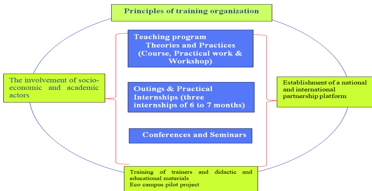
Figure 1: Training organization