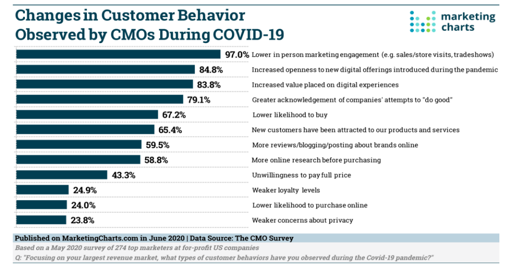
Figure 2: Changes in customer behavior observed by CMOs during COVID 19