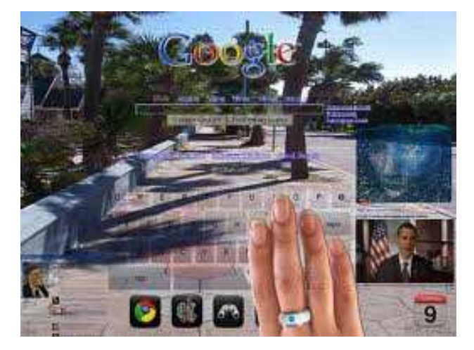
Fig 4: Computer Human Interface