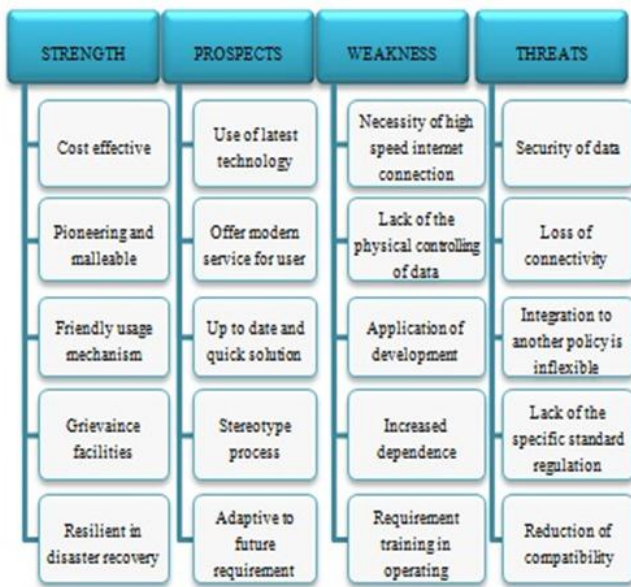
Fig 2: Strength, Prospects, Weakness and Threats of cloud computing in healthcare [16]

there they are numerous negative factors involved in adopting and implementing. Moreover, an adaptation of cloud computing increases the percentage of dependable of client or healthcare sector in this scenario to the service provider where it can indicate to the problem in future. Other than that, even in advance country, many hospitals do not have even internet connection especially in the urban area in order to connect to the cloud, thus implementing and practicing cloud computing is definitely will be tough. Therefore, it can be stated clearly fundamental and essential requirement for connecting to the cloud is the internet connection and moving forward towards it is simply impossible with the absence of requirement [15].